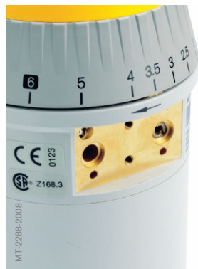
Permanent connection with the appropriate connector options (not shown)