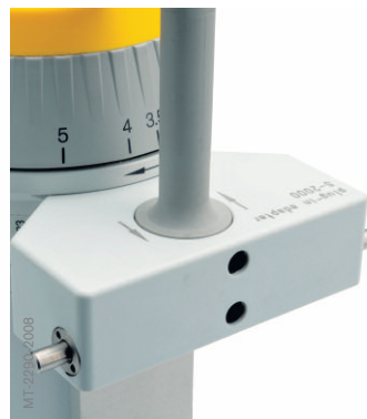
Plug-in S-2000 adapter with Interlock S