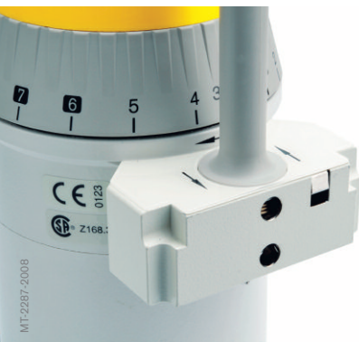
Auto Exclusion plug-in adapter